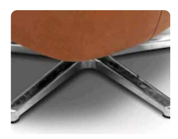
Foot Option 1: Stainless Steel Base