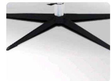
Foot Option 2: Stainless Steel Base Black Finish