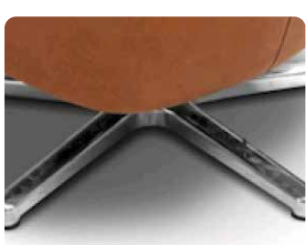
Foot Option 1: Foot Option 2: